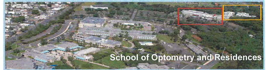
School of Optometry and Residences

Address: 500 John Will Harris Ave. (Rd. 830) Bayamón, PR 00957-6257 → School of Optometry → Residences