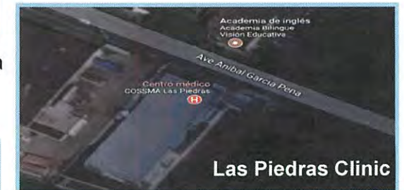
Las Piedras Clinic

Address: Ave. Rafael Cordero Final Caguas, PR 00725