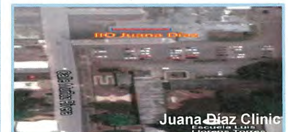
Juana Díaz Clinic

Address: Urb. Industrial El Jíbaro Cidra, PR 00739